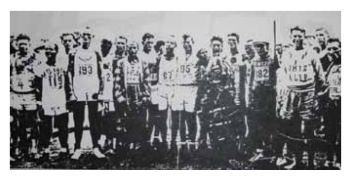
Survivors of the Bunion Derby 1928 ford the Hudson River.